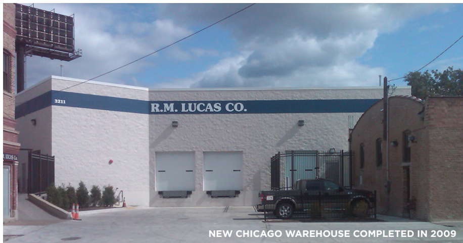
NEW CHICAGO WAREHOUSE COMPLETED IN 2009