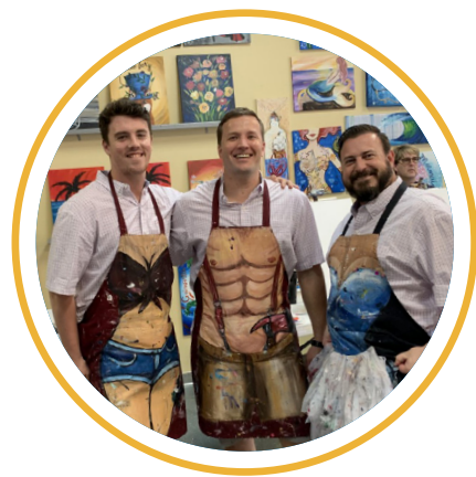
Painting With a Twist

Ropella is all about developing people, celebrating their successes, and creating meaningful promotions to help us thrive. The firm's challenging yet rewarding work environment offers different company incentives (bonuses, trips, lunch, etc.) to meet goals and competitive health benefits (life, vision, dental), as well as an outstanding PTO package.