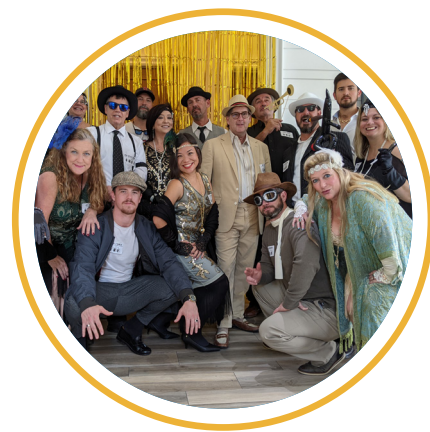
Annual Christmas Party

Ropella knows FUN is a vital investment—that's why we facilitate social connections among our team members.