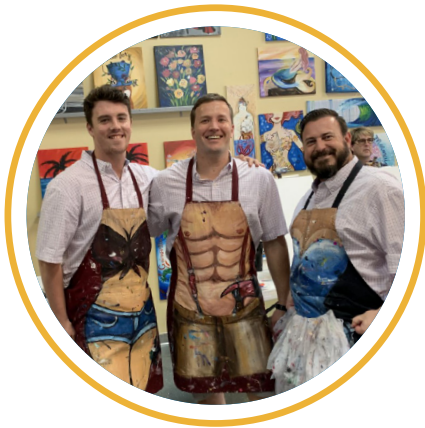
Painting With a Twist

Ropella is all about developing people, celebrating their successes, and creating meaningful promotions to help us thrive. The firm's challenging yet rewarding work environment offers different company incentives (bonuses, trips, lunch, etc.) to meet goals and competitive health benefits (life, vision, dental), as well as an outstanding PTO package.