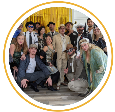
Annual Christmas Party

Ropella knows FUN is a vital investment—that's why we facilitate social connections among our team members.