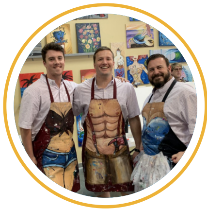
Painting With a Twist

Ropella is all about developing people, celebrating their successes, and creating meaningful promotions to help us thrive. The firm's challenging yet rewarding work environment offers different company incentives (bonuses, trips, lunch, etc.) to meet goals and competitive health benefits (life, vision, dental), as well as an outstanding PTO package.