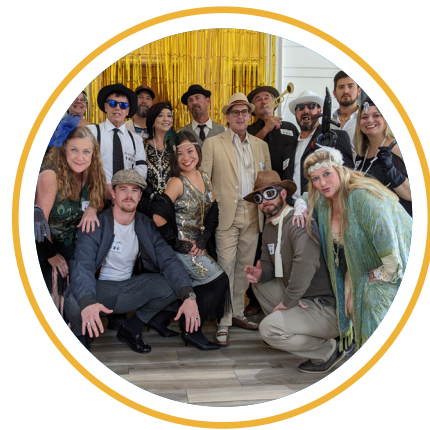
Annual Christmas Party

Ropella knows FUN is a vital investment—that's why we facilitate social connections among our team members.