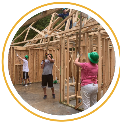
Habitat for Humanity