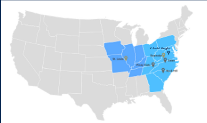
IPG'S GEOGRAPHIC FOOTPRINT ■ Chemsolv Service Area ■ Chemisphere Service Area